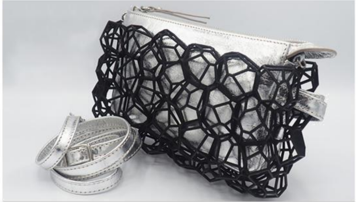
3D printed accessories/shoes